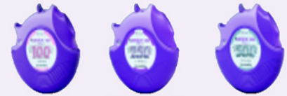
"ADVAIR" DISKUS" Inhalation Device (Salmeterol xinafoate/fluticasone propionate) Available in 100, 250 & 500 mcg per dose 1 inhalation BID GlaxoSmithKline