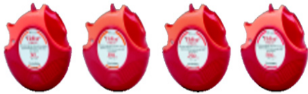
"FLOVENT" DISKUS" Inhalation Device (Fluticasone propionate) Available in 50, 100, 250 & 500 mcg per dose GlaxoSmithKline