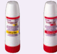
"SYMBICORT" TURBUHALER" (Budesonide/formoterol fumarate dihydrate) Available in 100 & 200 mcg per dose AstraZeneca