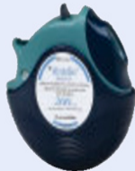
"VENTOLIN" DISKUS" Inhalation Device (Salbutamol sulfate) 200 mcg per dose GlaxoSmithKline