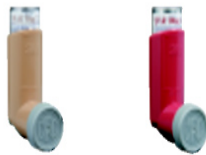
"QVAR" (Beclomethasone dipropionate) Available in 50 & 100 mcg per dose 3M Pharmaceuticals