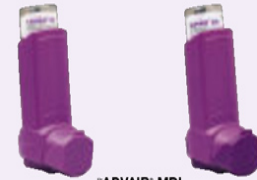
"ADVAIR" MDI (Salmeterol xinafoate/fluticasone propionate) Available in 125 & 250 mcg per dose 2 puffs BID GlaxoSmithKline