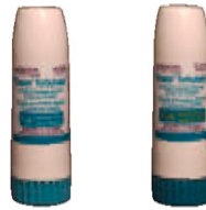
"OXEZE" TURBUHALER" (Formoterol fumarate dihydrate) Available in 6 & 12 mcg per dose AstraZeneca