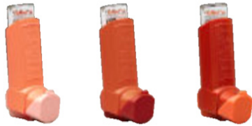
"FLOVENT" HFA (Fluticasone propionate) Available in 50, 125 & 250 mcg per dose GlaxoSmithKline