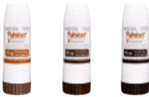
"PULMICORT" TURBUHALER" (Budesonide) Available in 100, 200 & 400 mcg per dose AstraZeneca